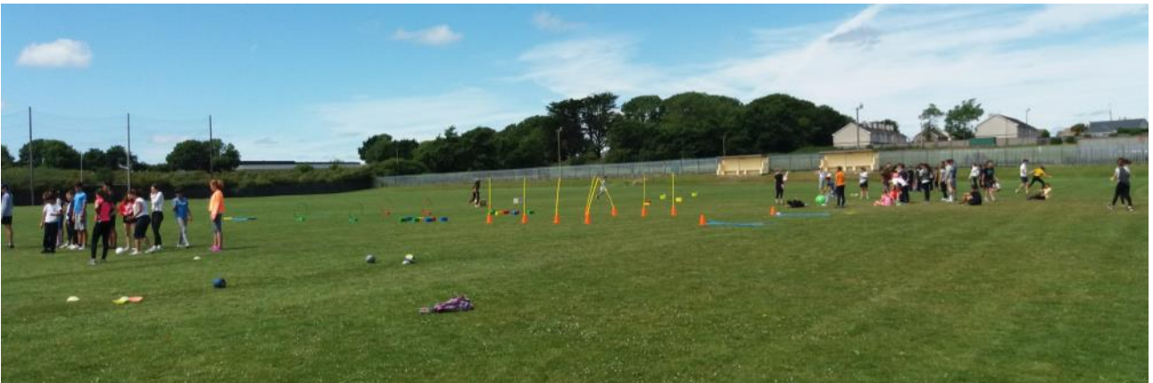
Rugby and hurley fields