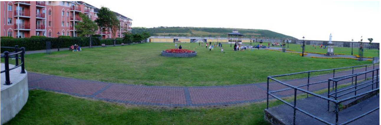
Parks and gardens