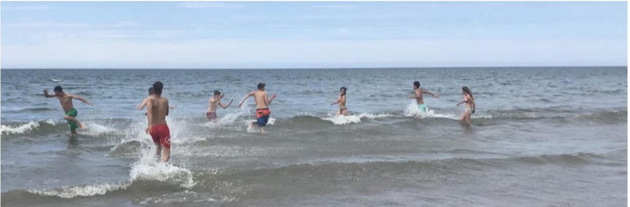
Coastal town with beach